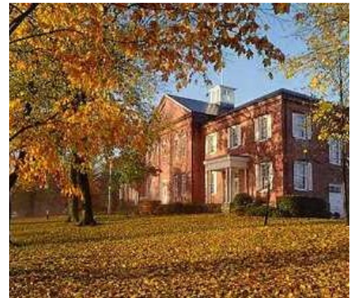
Mather Training Center at Storer College