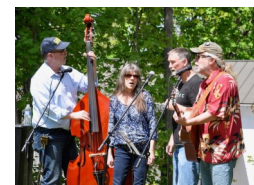
Musicians from last year's festival.

Help send off some of our 2017 crop of Flip Flop hikers (Harpers Ferry to Maine, returning for Harpers Ferry to Georgia) at a pancake breakfast 7-9 am, Sunday morning at Camp Hill-Wesley Methodist Church. Workshops and guided hikes will continue on Sunday, April 23.