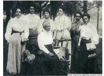
Students at Storer College

Contact: Autumn Cook at autumn_cook@nps.gov .