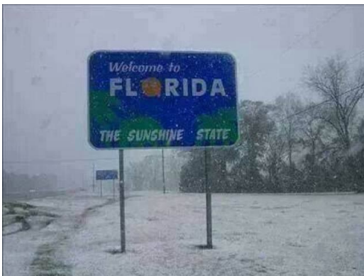
We are not in this alone.....

In response to confusion over what is in the proposed zoning ordinance and related ordinances and standards, the Planning Commission has posted on the Planning page , a two page summary of Key Facts that provides clarification. This summary also addresses the status of the Hilltop Hotel as of January 7.