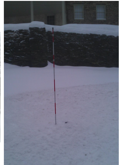
Where is the fire hydrant ?