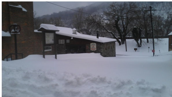
Anyone want to take a drive on Hog Alley?