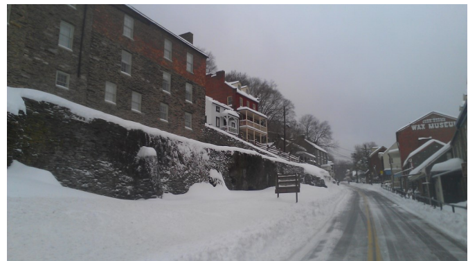
Looking up High Street