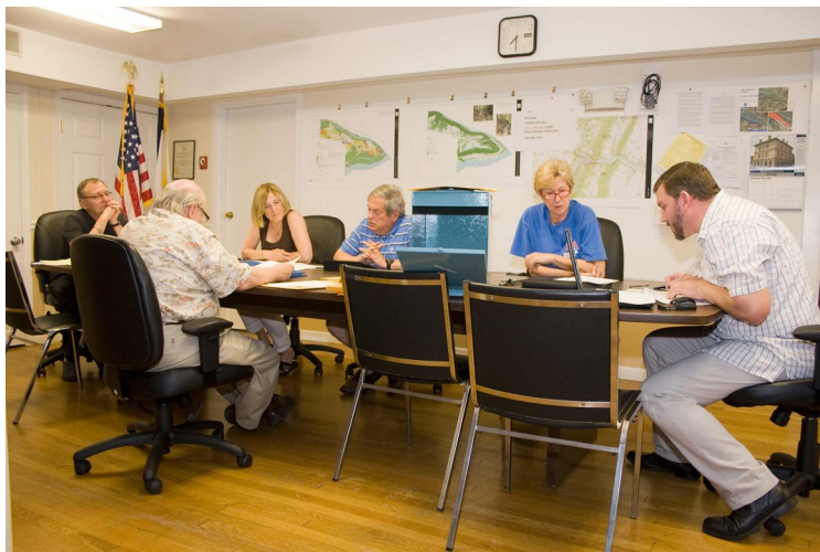
The Board of Canvassers meets to affirm the election results

Anyone wishing to review any of the documents or information considered by the Council (the Council "packet") for past (or pending) meetings can find them on the town website ( www.harpersferrywv.us ) under "Council Docs." The documents are posted to the website the Friday before regular Council meetings. A paper copy is also available in a public meeting notebook available at Town Hall.